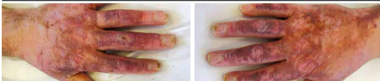
After 3 months of ALHYDRAN therapy