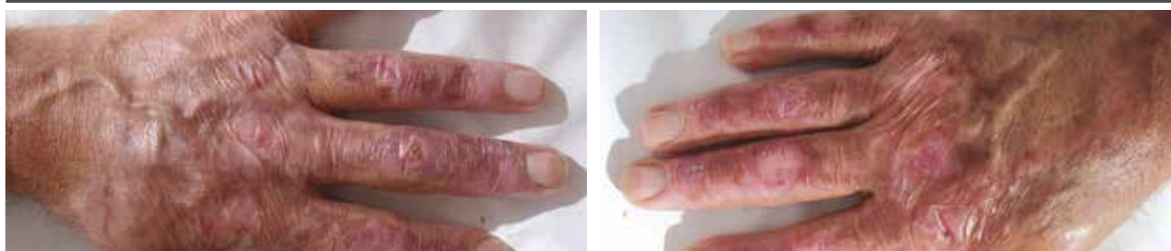
After 6 months of ALHYDRAN therapy