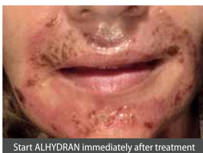
Start ALHYDRAN immediately after treatment