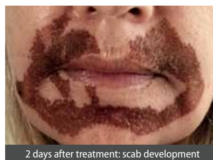
2 days after treatment: scab development